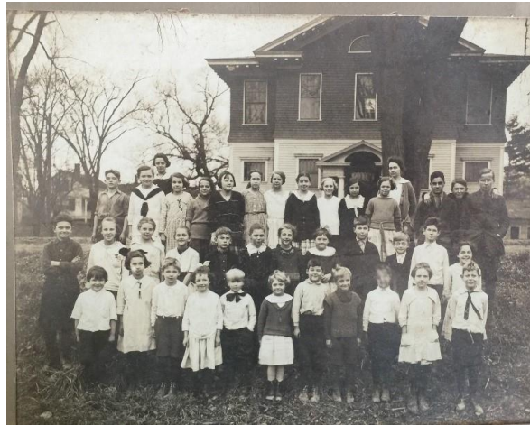
Canaan Schools in History

In addition to local businesses, we are seeking local musicians, food vendors, artists and craft persons as exhibitors. Please spread the word among the members of your organizations. We know there are lots of hidden treasures in Canaan!