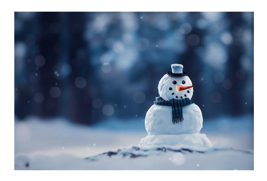
A Note from Our Supervisor