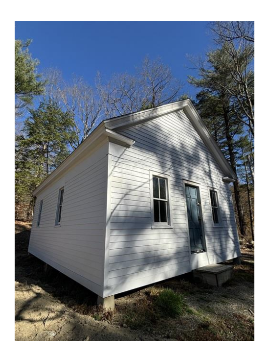
Red Rock One Room Schoolhouse continues to make progress ...

The Red Rock Historical Society Schoolhouse Restoration Committee is pleased to report that the exterior landscaping is done, and the outside of the building is repaired, painted and buttoned up for the winter.